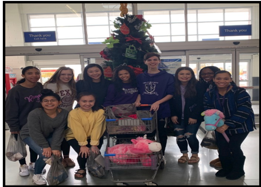
The Royals purchasing gifts for their adopted Angel Tree kids!

IHS students and organizations continue to give back!!