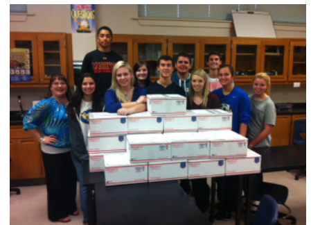
NHS Students

The care packages were mailed along with lots of letters written to our soldiers by our student body volunteers. After the care packages were done, there was even enough donations left over to make a donation to Frisco Family Services as well. Way to go Raccoons!