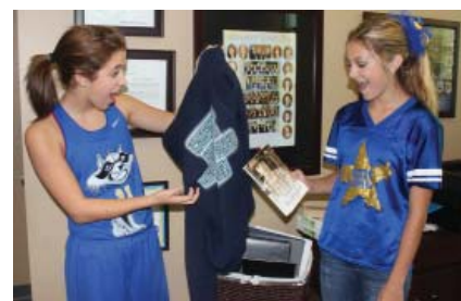
"Lost and Found"

Check out the Lost and Found first. It just might be waiting for you in the office.