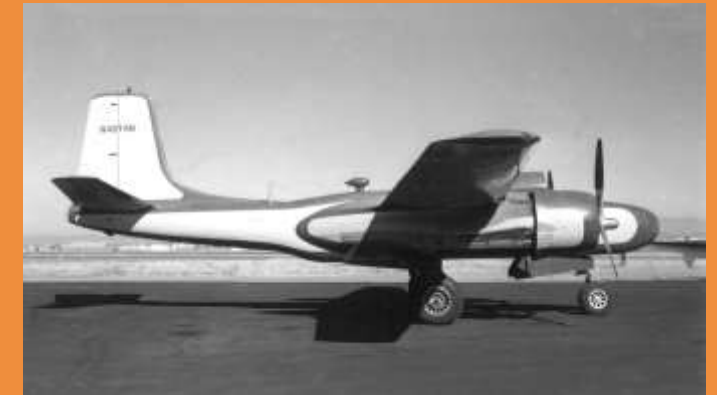
R.G. LeTourneau Corporate Aircraft (A-26 Invader)