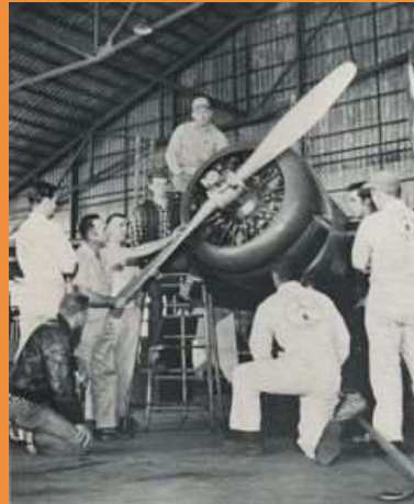
1958 – LETU Maintenance Department