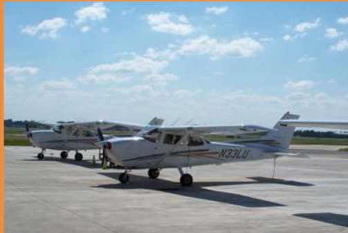
Cessna 172 Skyhawk