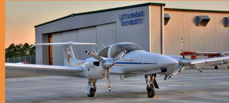
Diamond DA-42 Twin Star