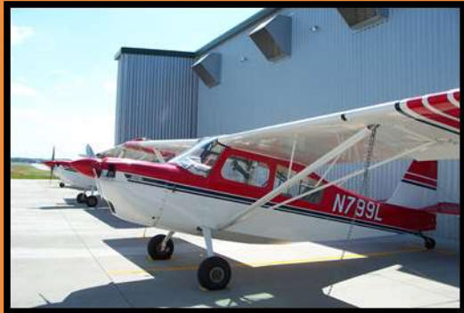
American Champion Citabria